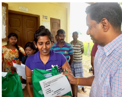
↑ Flood relief (Below)

Flood relief in the North-East: Heavy, frequent rains in December 2019 brought severe flooding in a number of poor villages in the Vaharai and Kiran areas in Batticaloa district and 4 villages around Irranamadu kulam in the North. A few people and many livestock were lost. Damages to the houses/ huts were considerable. SCOT gave immediate relief (dry rations, in-