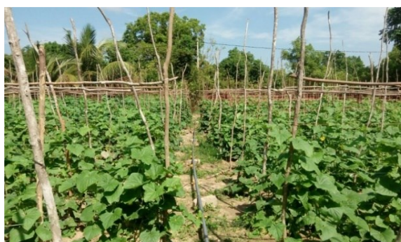
Cucumber crop of a small-holder farmer using SCOT funded drip irrigation in Tharmapuram, Kilinochchi District

Drip Irrigation: SCOT pioneered a demonstration farm (vegetables) in Vanni and examined improved cultivation practices during 2014-17. The resulting findings and recommendations are being taken up by local organisations, fine-tuned and passed on to small groups of farmers in different villages. Since 2018, the total number of beneficiaries has exceeded 250. (SCOT's funding: £14,000)