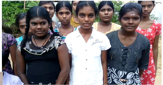
↑ Girls at Vivekanada Girl's Home Batticaloa (Above)

Children in Homes / Orphanages: SCOT has been contributing to the operation of selected 3-5 orphanages / children's homes every year in the North and East since 1990. (SCOT's contribution: a total of £4,000 - £6,500 each year)