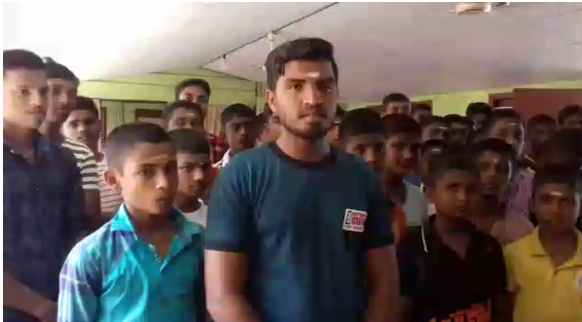
← Boys at Hari Children's Home Batticaloa (Left)